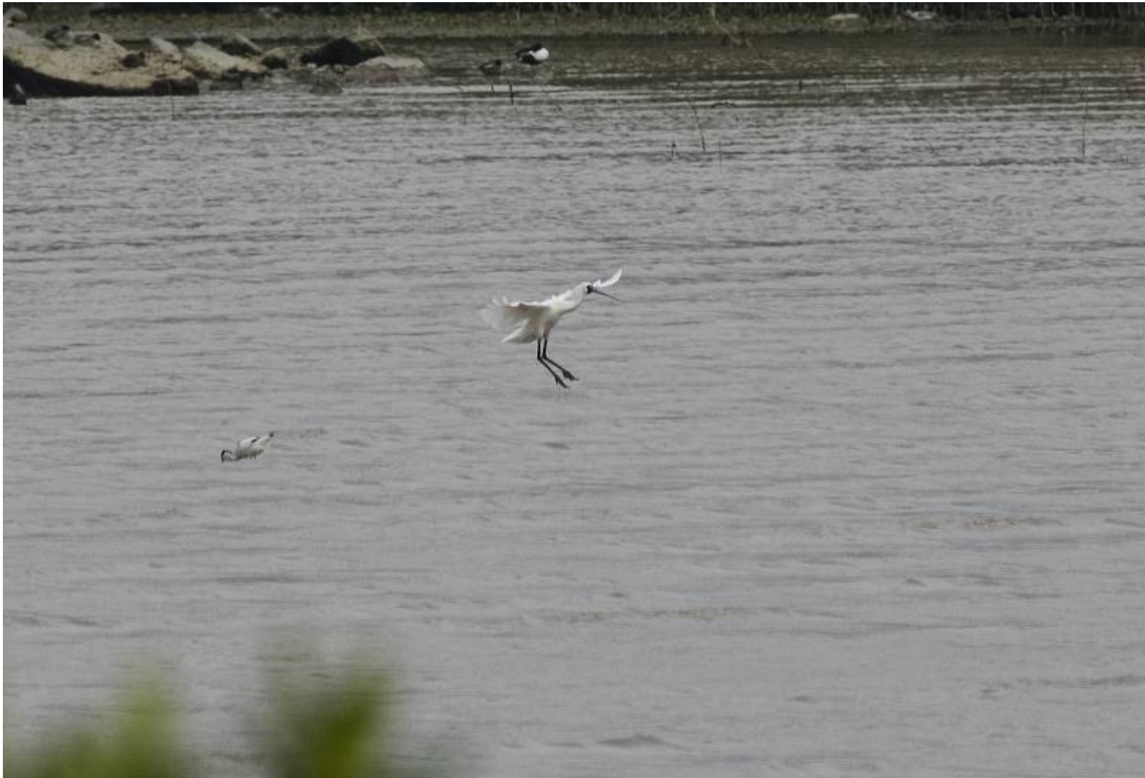
the extremely rare black-faced spoonbill